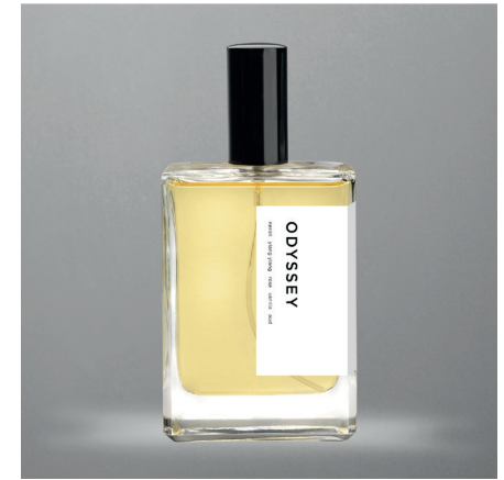
fig wood / musk / ginger / lime zest bergamot / vanilla / violet / peony / lily

Simple and tranquil, Mount Fuji Rice Flower is a delicately blended fragrance combining rice flower, fig and vanilla.