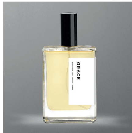
fig wood / fig leaf / green leaf

A timeless favourite, Figue embodies the classic earthy fragrances of fig tree and fresh ripe figs.