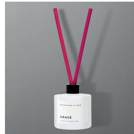
fig wood / fig leaf / green leaf

A timeless favourite, Figue embodies the classic earthy fragrances of fig tree and fresh ripe figs.