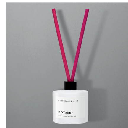
fig wood / musk / ginger / lime zest bergamot / vanilla / violet / peony / lily

Simple and tranquil, Mount Fuji Rice Flower is a delicately blended fragrance combining rice flower, fig and vanilla.